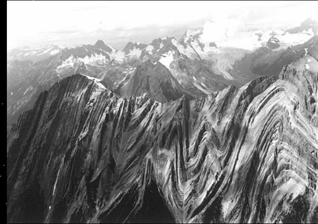
The real world